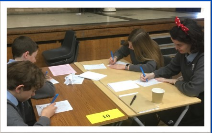
Students from Y8 & 9 travelled to Holy Trinity School on 6th March where they took part in a Maths Team Challenge. Competing against 20 other schools, mostly private and grammar, they did really well and came 14th.